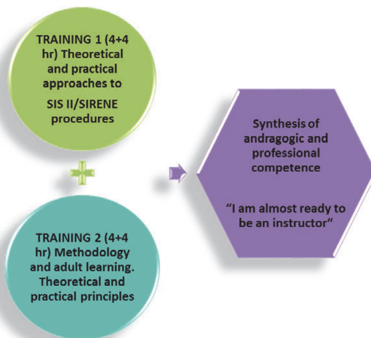
Figure 3 – “Andragogic and advanced subject matter training” in detail

During the realization of each element of integrated training of trainers, the balance between theoretical and practical knowledge is set. For example, while organizing first to third elements of the integrated training of trainers, the proportion of time allocated for theoretical and practical sessions was equal and amounted to 4 hours of theory and 4 hours of practical exercises (role-play, simulation, case analysis etc.) (see Figure 3).