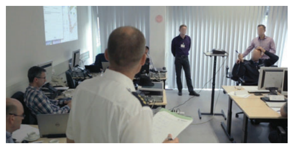
Figure 4: TC2 trial in September 2017 in Oranienburg, Germany

Training content scenario 2 is led by the Fachhochschule der Polizei des Landes Brandenburg. This training scenario is aimed at preparing police officers as members of command post bodies for large scale police operations to deal with crowd control and protection of a critical infrastructure. The target group for this exercise are commanders and command and control personnel at a tactical as well as strategic level.