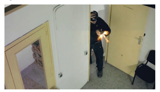
Figure 6: TC4 trial in October 2017 in Mollet del Vallès, Spain

Training content scenario 4 is led by the Police School of the Institute for Public Security of Catalonia with the contribution of Guardia Civil. This is a decision-making scenario in firearms situations. The objective of the training is not to have a virtual shooting gallery, but train above all the decision making about using firearms. Security forces can find themselves in situations in which they need to use firearms. The challenge is to achieve a realistic, dynamic and safe training system with fewer resources.