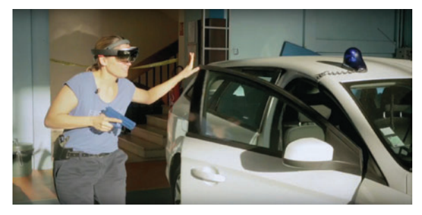
Figure 7: TC5 trial in October 2017 in Saint Cyr au Mont d'Or, France

This training scenario is led by l'Ecole Nationale Supérieure de Police at Lyon (France). The script starts with two police officers who are in a police car, driving through the city. A car advances at very fast speed and turns in a corner crashing. The police car also turns and police officers notice that the car that had advanced them has suffered an accident. The driver is unconscious, but after a few seconds the passenger opens the door and leaves the car. From here there are multiple situations where the trainees are asked to assess the threat and neutralise suspects.