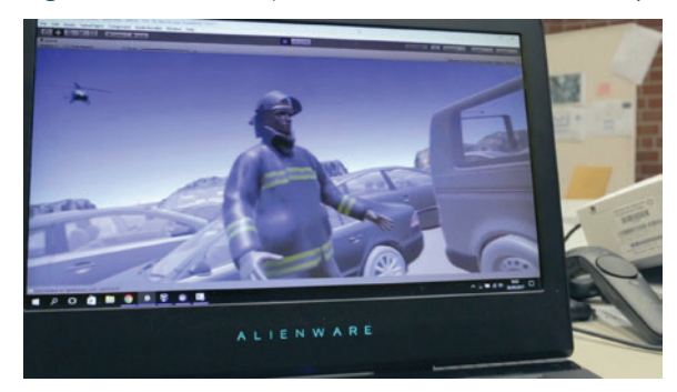
Figure 8: TC6 trial in September 2017 in Münster, Germany

This training content scenario is led by the German Police University at Münster. The objective of the training is to provide a realistic training situation to encourage confidence building in large scale operations. The story line is based on a real multiple collision that took place on a German motorway with about 51 cars and more than 100 injured persons involved. The scenario setting is a rural area. The accident is caused by a rear-end-collision of two cars due to heavy fog. Fifty cars, a minivan with fifteen children and a tanker truck, loaded with more than 30.000 litres of petrol / flammable liquids, are involved. There is a high risk of explosion