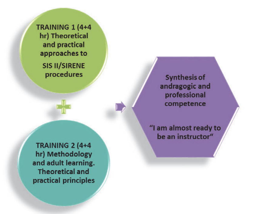
Figure 3 – "Andragogic and advanced subject matter training" in detail

During the realization of each element of integrated training of trainers, the balance between theoretical and practical knowledge is set. For example, while organizing first to third elements of the integrated training of trainers, the proportion of time allocated for theoretical and practical sessions was equal and amounted to 4 hours of theory and 4 hours of practical exercises (role-play, simulation, case analysis etc.) (see Figure 3).