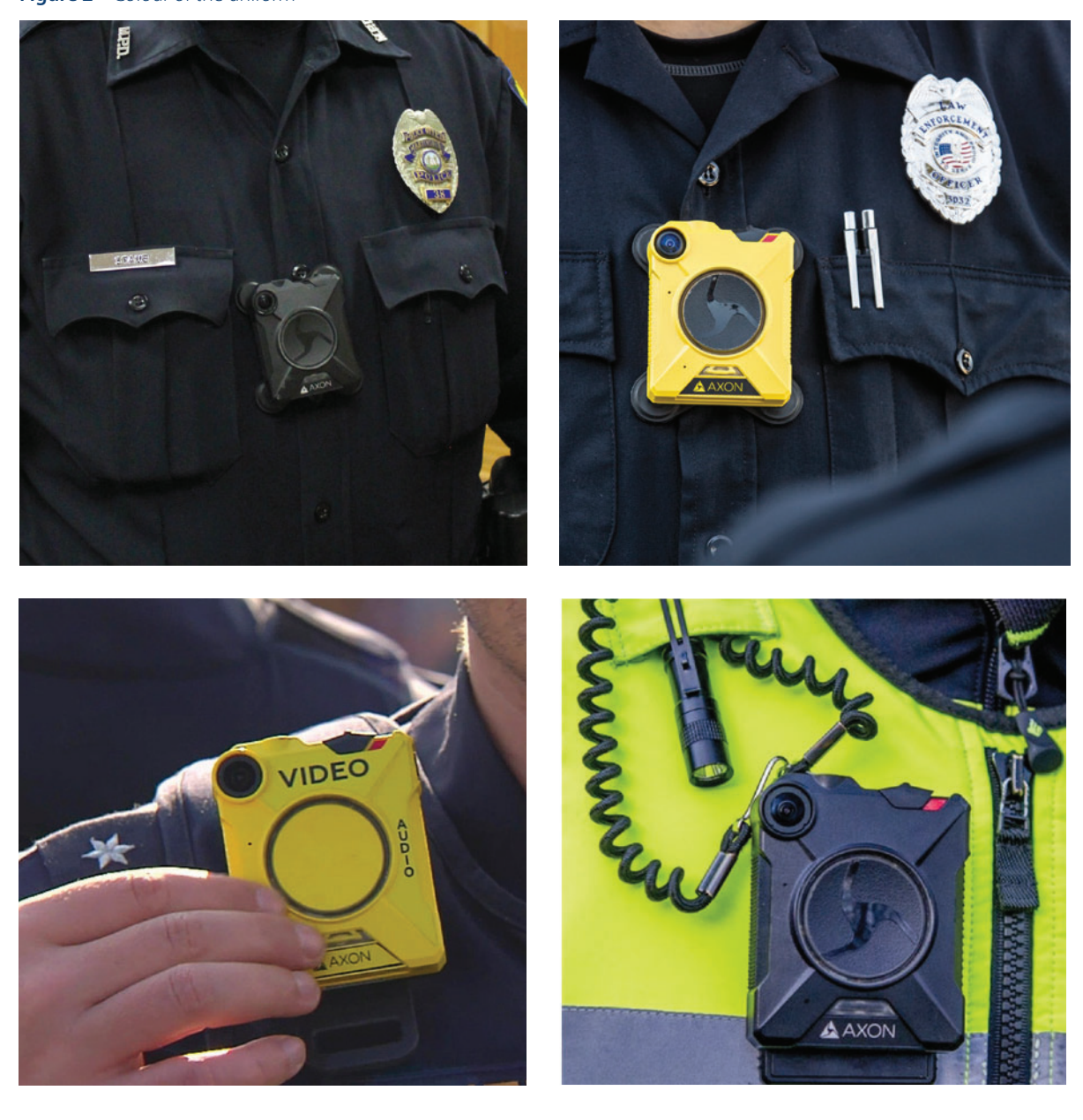
Figure 2 – Colour of the uniform

A black box on a black uniform (top-left) is less visible than a yellow box (top-right and bottom-left). But not if the uniform itself is yellow, in which case the black bodycam is easy to see (bottom-right). The point here is not whether more visibility is necessarily better: that