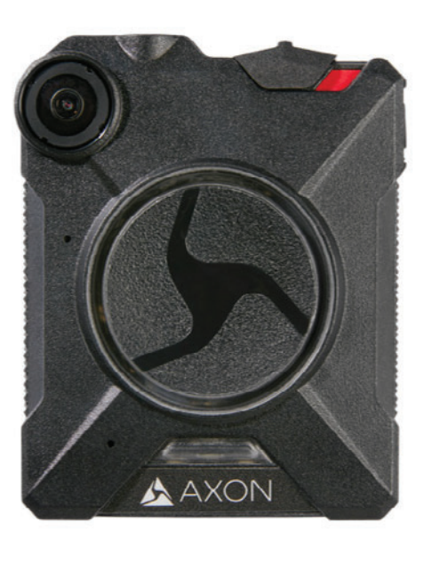
Figure 1 – The device