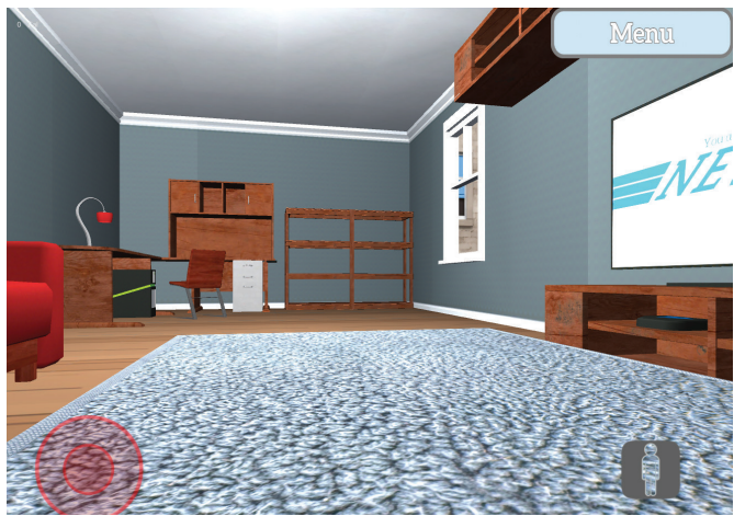
Figure 4: Crouch mode