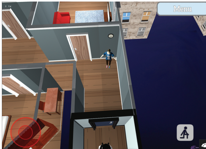
Figure 6: 2-d mode

Our initial evaluation demonstrates that the prototype has the potential to be scaled to force-wide proportions. Feedback from our evaluation demonstrated that participants were very positive about using games on mobile devices for training. There was some disparity between the answers that participants gave to the interview questions and in-game questions. The questionnaire indicated that some participants found the wording of the scenarios rather vague, which made the questions somewhat ambiguous. Finally, some officers found the navigation controls difficult to use and indicated that they would prefer to be able to indicate via touch-control how to navigate, rather than use a virtual joystick. Overall, participants responded positively about their experience of using the game and its potential for providing training in cybercrime response.