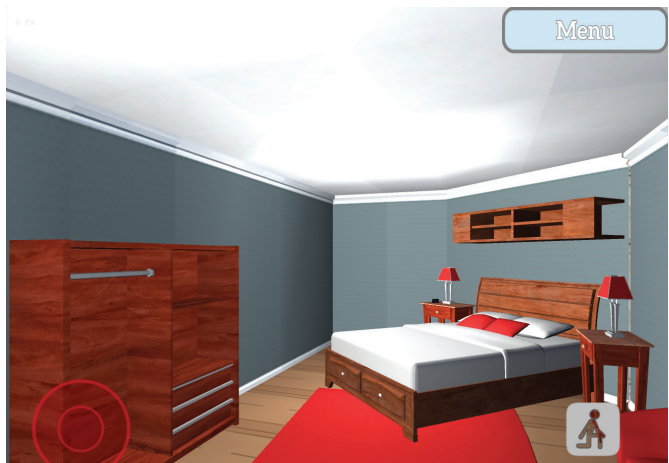
Figure 5: 3-d mode