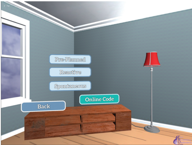
Figure 1: Prototype menu showing 3 scenarios

ronment. Whilst navigating the environment for each scenario, users are presented with a series of questions depending on their interactions with various different objects (see Figure 3). Users can choose between crouch mode, which enables the user to look underneath objects (Figure 4), standard 3d mode (Figure 5) and 2d mode (Figure 6). At the end of each scenario, users are presented with their score and feedback on any incorrect answers.